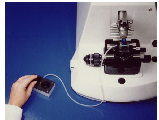
WATER TROUGH FILLER (PERISTALTIC WATER PUMP)