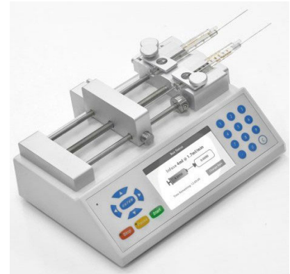
AUTOMATED WATER LEVEL CONTROL SYSTEM (for use with PTPCZ, PT3D, and ATUMtome)