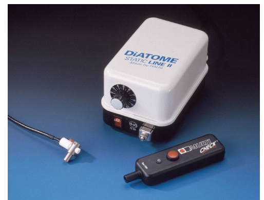
STATIC LINE IONIZER, 110VAC or 220 - 240VAC