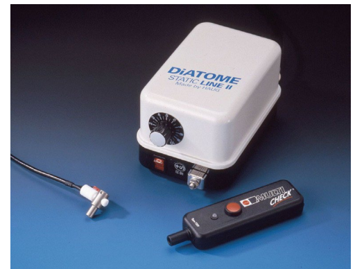
STATIC LINE IONIZER, 110VAC or 220 - 240VAC