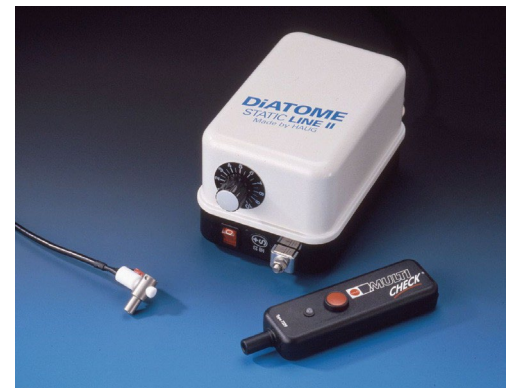
STATIC LINE IONIZER, 110VAC or 220 - 240VAC