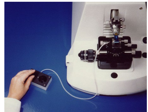
WATER TROUGH FILLER (PERISTALTIC WATER PUMP)