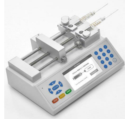
AUTOMATED WATER LEVEL CONTROL SYSTEM (for use with PTPCZ, PT3D, and ATUMtome)