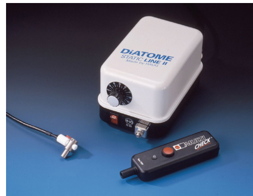
STATIC LINE IONIZER, 110VAC or 220 - 240VAC