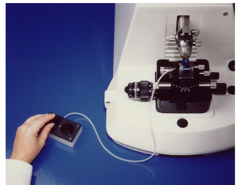
WATER TROUGH FILLER (PERISTALTIC WATER PUMP)