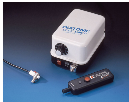
STATIC LINE IONIZER, 110VAC or 220 - 240V