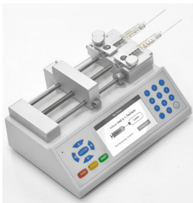
AUTOMATED WATER LEVEL CONTROL SYSTEM (for use with PTPCZ, PT3D, ATUMtome)