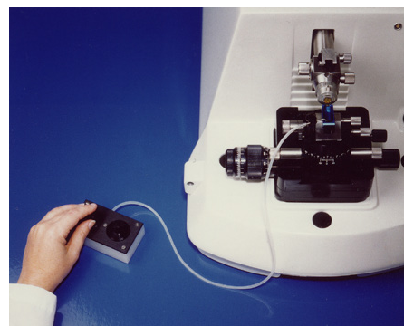
WATER TROUGH FILLER (PERISTALTIC WATER PUMP)