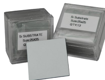
Si Substrate, 25mm x 25mm(25 pcs.)