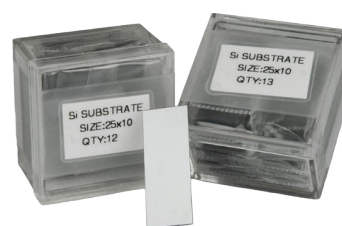
Si Substrate 10mm x 25mm(25 pcs.)