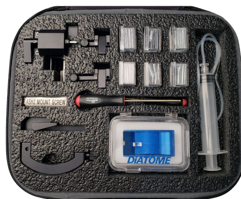
Accessory Kit, shown with optional Leica Ultramicrotome Adapter Clamp, and optional Diatome Ultra Jumbo Diamond Knife