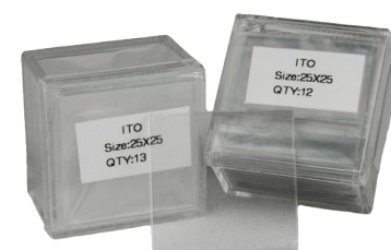
ITO Coverslip 25mm x 25mm(25 pcs.)