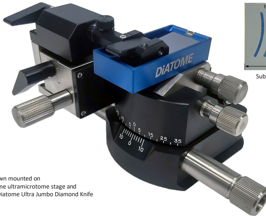
ASH2 shown mounted on PowerTome ultramicrotome stage and optional Diatome Ultra Jumbo Diamond Knife