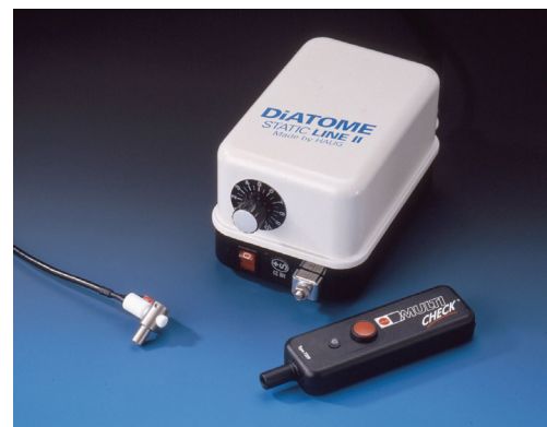
STATIC LINE IONIZER, 110VAC or 220 - 240VAC