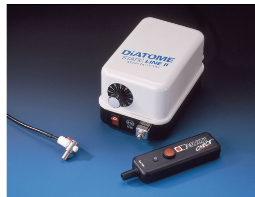
STATIC LINE IONIZER, 110VAC or 220 - 240V

Maintains constant water level in knife boat, automatically adjusting as required. For use with PTPCZ, PT3D, ATUMtome.