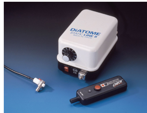
STATIC LINE IONIZER, 110VAC or 220 - 240V

Maintains constant water level in knife boat, automatically adjusting as required. For use with PTPCZ, PT3D, ATUMtome.